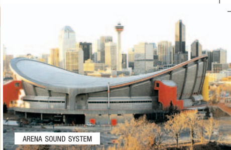
ARENA SOUND SYSTEM