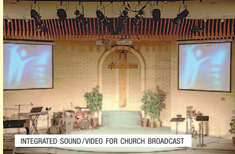
INTEGRATED SOUND/VIDEO FOR CHURCH BROADCAST