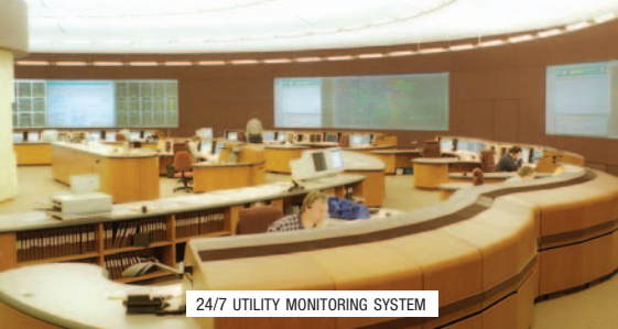
24/7 UTILITY MONITORING SYSTEM