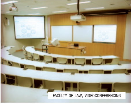
FACULTY OF LAW, VIDEOCONFERENCING