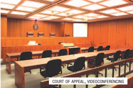
COURT OF APPEAL, VIDEOCONFERENCING