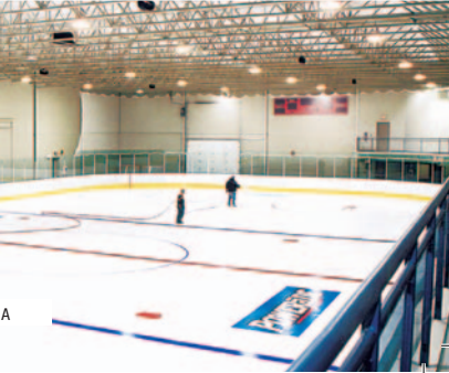
RECREATION CENTRE INTEGRATED SYSTEM FOR LEISURE ICE SKATING, AQUATICS AND A HOCKEY ARENA